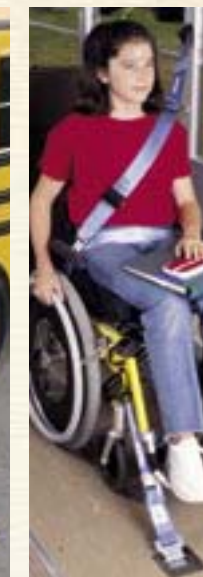
Special needs equipment, such as Braun, M... and Pison lifts. Sure-Lok and O'Straint wheelchairs.