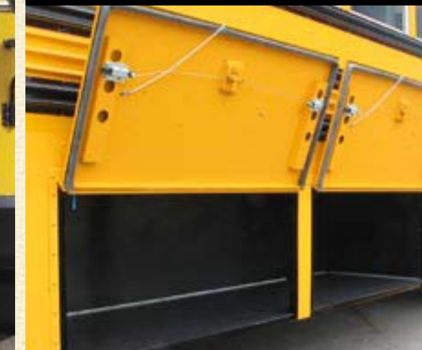
Spacious under-floor luggage bays provide ample storage for equipment and other belongings.