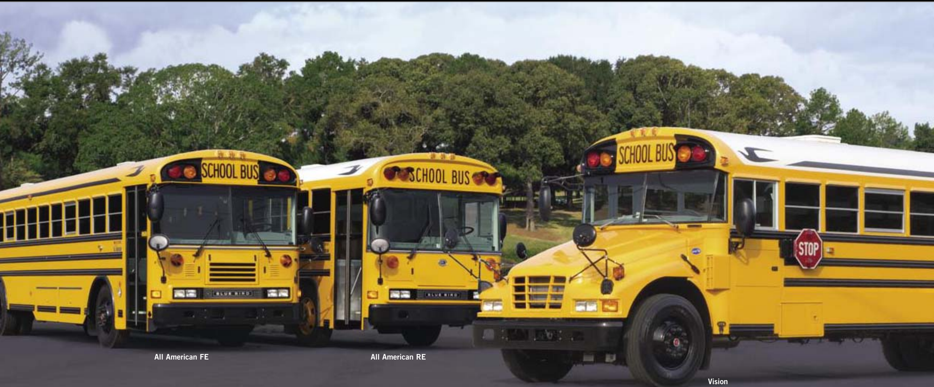
All American FE