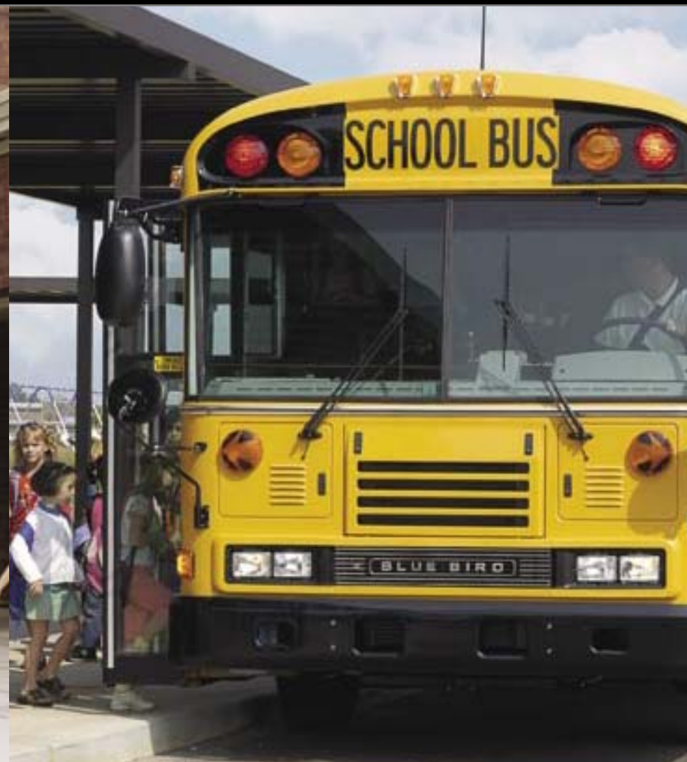
The flat front, transit-style design features a large panoramic windshield.