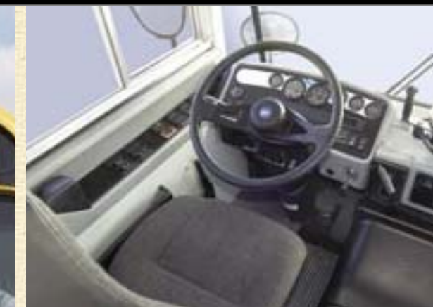
The ergonomically designed driver area with easy-to-read gauges, puts all switches and controls within convenient reach of the driver.